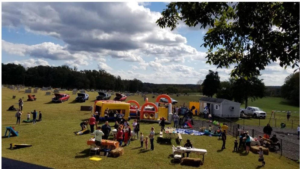
The weather was beautiful for jumping on inflatables, car show, corn hole, dunking booth and much more!

JONES CHAPEL: The Family Fun Festival brought out a great crowd on Saturday, October 23. (See pictures below.) Jones Chapel packed Kindergarten bags and provided new blankets for the Hope for Appalachia winter wear collection. They also provided 5 trunks of candy at the October 29, Trunk-or-Treat held behind Cumberland Court House. Members donated candy for the Youth to pre-package and hand out at the event. A special offering was received on October 31, for the Amish Family involved in the accident in Cumberland County. Jones Chapel extends their sincere sympathy to the children and the Amish Community.