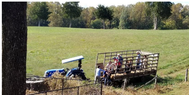
Jake Fulcher took kids and adults on a hayride where they were able to visit the “pumpkin patch” and bring back a nice big pumpkin. Hayrides were a big hit!