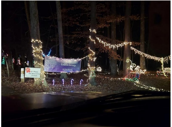
Jones Chapel Light Display at Bear Creek Lake

SHARON: Rose of Sharon WMU continues providing meals, cards, phone calls, and visits to those who are sick or homebound. The congregation contributed $161.11 to Christ in Christmas and $162.11 to GraceInside, provided gifts of toiletry items for residents of Heritage Hall, and assisted a family of seven who lost everything in a house fire.