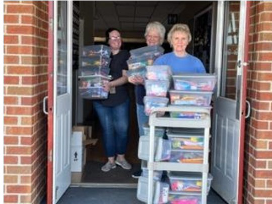
Antioch's Boxes of Hope leaving the church for delivery.

ANTIOCH (SCOTTSVILLE): Items have been collected to fill 130 boxes for American soldiers in Africa. Folks gathered at the church on March 29, to pack the boxes. The Loaves and Fish Ministry began serving a hot meal again on March 26, as well as continuing to distribute food boxes. They served 11 hot meals and gave out 70 food boxes. Antioch members also prepared 257 Boxes of Hope.