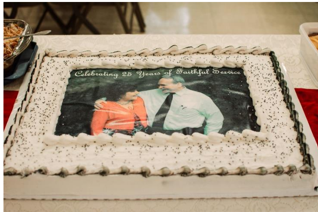
Below: 25 th Anniversary cake for the celebration