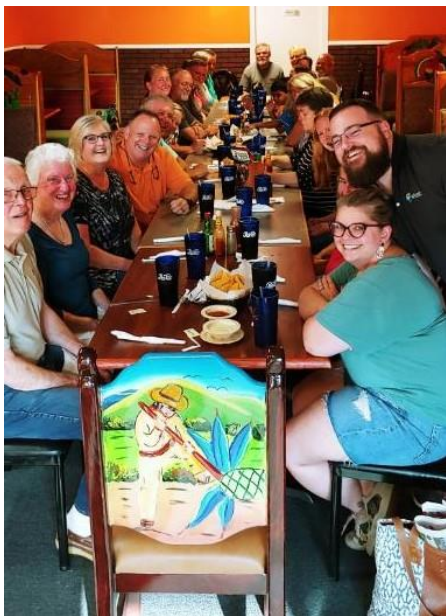
ANTIOCH (SCOTTSVILLE): A Sunday School Fellowship Dinner was held on Tuesday, July 12, for the Generation Class. A great time was enjoyed by all.