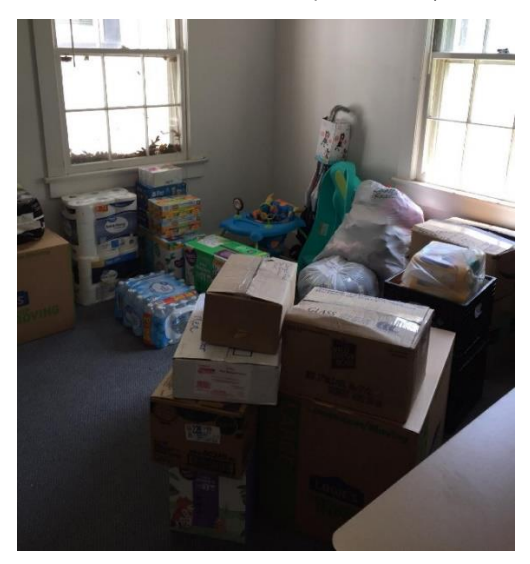
TAR WALLET: The church donated $300 towards expenses for the trailer going to Kentucky and over $600 in emergency supplies for the flood victims. Items included baby items (formula, wipes, diapers, shampoo, rash cream, pacifiers, etc.), cleaning supplies, Tylenol, paper products, plastic cutlery, men's women's, and children's shoes, Depends, etc. (Pictures below of items boxed and ready for loading.)