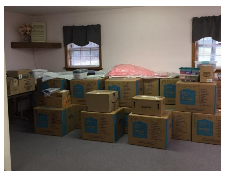
SHARON: The congregation contributed $205.00 to BGAV Disaster Relief to aid with recovery efforts in flood-ravaged areas of Kentucky. Rose of Sharon WMU continues providing meals, visits, calls, and notes of encouragement to those who could use a little extra love and care.