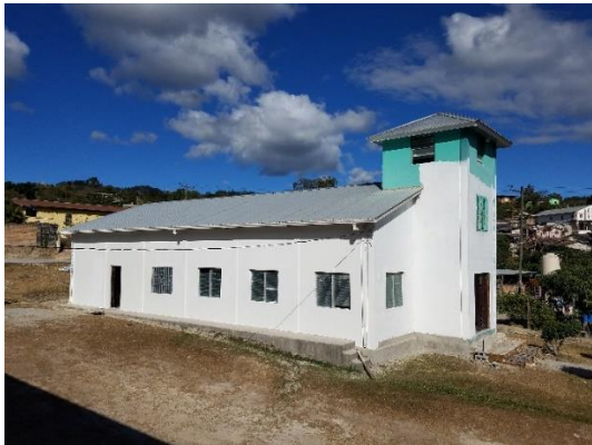
New Covenant Baptist Church

I participated, along with twenty-one other volunteers (primarily from Liberty Baptist Church, Appomattox), on a mission trip to Siguatepeque, Honduras.