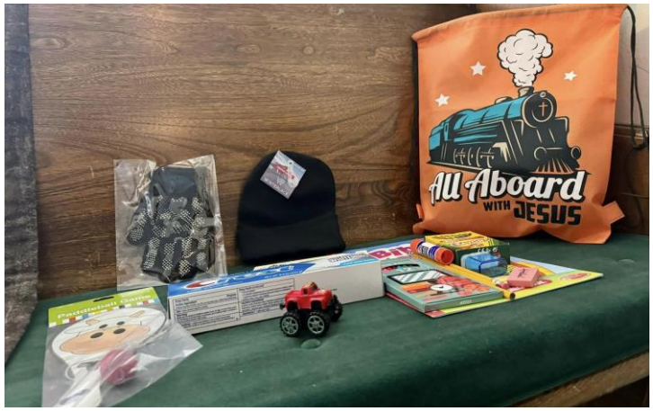
Pre-K and K bags each contained a hat, gloves, a coloring book, crayons, markers, colored pencils, pencils, an eraser and pencil sharpener, a paddle ball, scrunches for the girls, a toy car for the boys, a glue stick, a toothbrush, and toothpaste.

ANTIOCH (SCOTTSVILLE): In addition to packing 432 shoeboxes for Operation Christmas Child, Antioch also held its 2023 Election Coffee, providing free coffee and snacks to the election officials and voters. On November 3, their Adaptive Activity and Family Meal for special needs students of the Fluvanna High School was enjoyed by all in attendance. They were served a spaghetti and salad meal followed by an ice cream bar where the students were able to choose their ice cream flavor and toppings. Some families also enjoyed playing pool and foosball in the youth wing of the church. Their Fall Festival was held on November 4. Truly a family event with free entertainment, games, and food, it was hard to determine if the 100+ members/workers or the 500+ guests that attended enjoyed themselves the most! Antioch members look forward each year to giving this gift to their community.